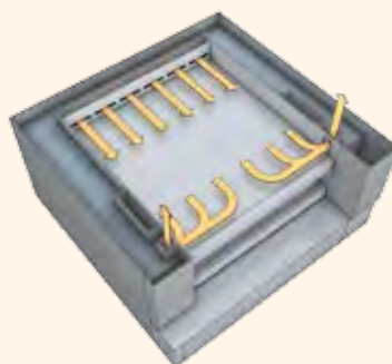
// Steam distribution system