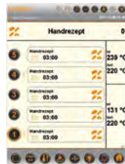
// WP NAVIGO II PROFICONTROL plus