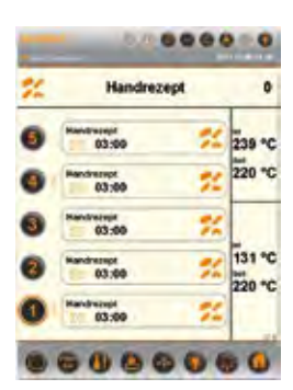
// WP NAVIGO II PROFICONTROL plus