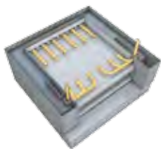
Steam distribution system