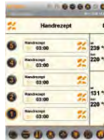
WP NAVIGO II PROFI-CONTROL