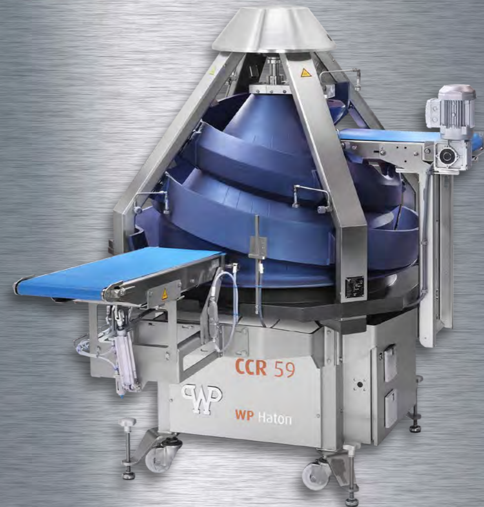
CCR 59 Conical Rounder

2 Trap Falls Road, Suite 105, Shelton, CT 06484 // Phone 203-929-6530 // Fax 203-929-7089 // info@wpbakerygroupusa.com // www.wpbakerygroupusa.com